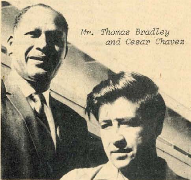
Mr. Thomas Bradley and Cesar Chavez

The purpose of this convention is to elect the state officers and to establish a more solid and active political participation and involvement of the Filipinos in the State of California. The reason behind why this convention is being held in Delano is to acquaint the FAPA and the people around the happenings in the city regarding the strike. Since the purpose and objective of the FAPA is aligned in the workers' struggle for a better living socially, morally, and spiritually, it is a must that the FAPA would support and endorse the strike and the boycott.