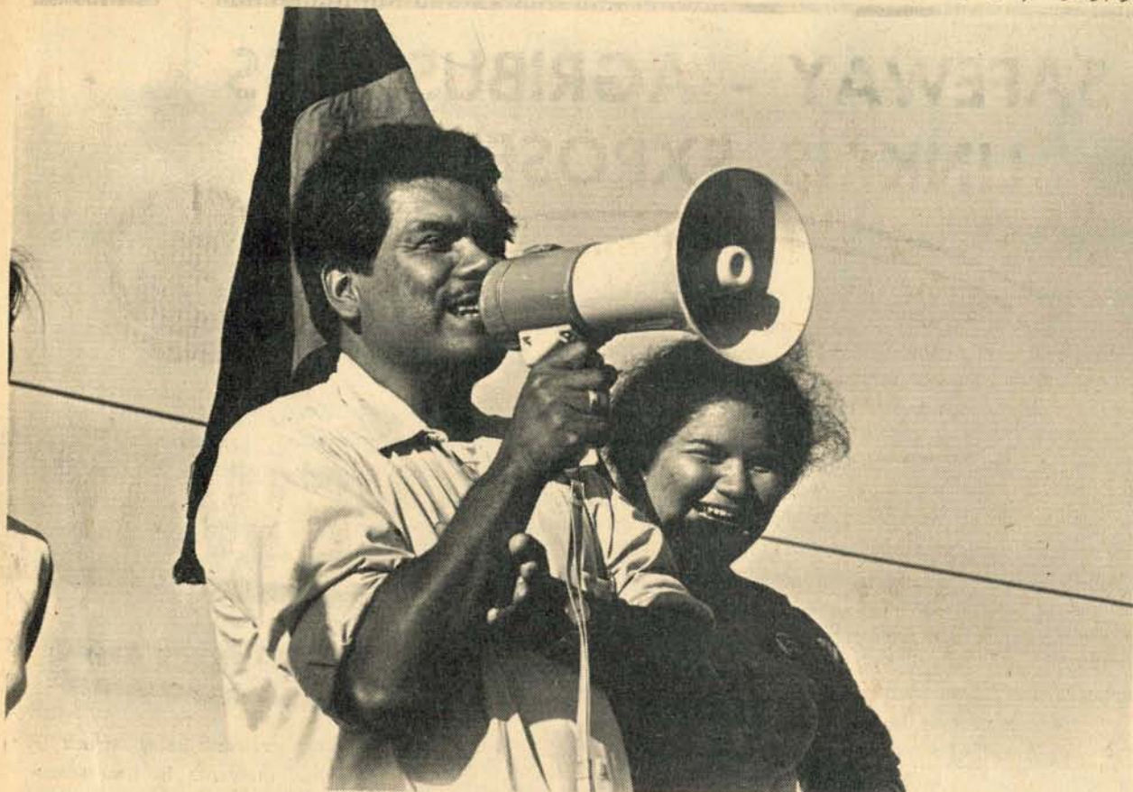
Strikers speak to workers during Coachella Valley strike, June, 1968.